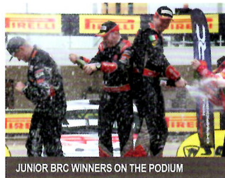
JUNIOR BRC WINNERS ON THE PODIUM