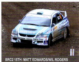
BRC2 15TH: MATT EDWARDS/WIL ROGERS

📍 Pirelli Carlisle Rally 📅 30 Apr - 01 May 2016 🏠 Cumberland Sporting Car Club 🏁 Stages: 7 Starters: 57 Finishers: 41